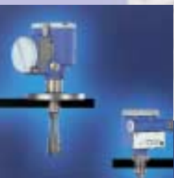
Vibration limit detection