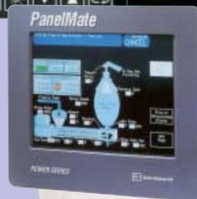
Man-machine interface, Industrial Computer