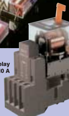
Miniature Relay 10 mA-10 A