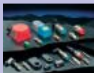
Inductive sensors Capacitive sensors