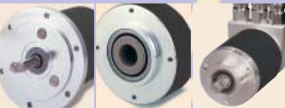
Incremental and absolute encoder